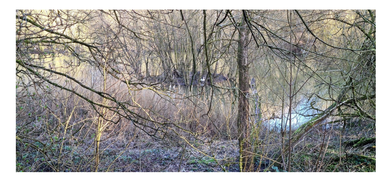
Pond view